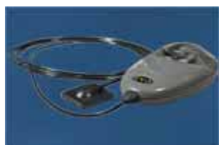
Digital Intra-Oral X-ray for under $8000.00

Dento-Surg 90 F.F.P Redefine your Dental Practice with Radiofrequency Technology. Increase Revenue, Reduce Operative Time