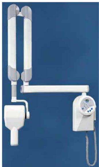
Looking for a new Digital Ready X-ray? AC or DC